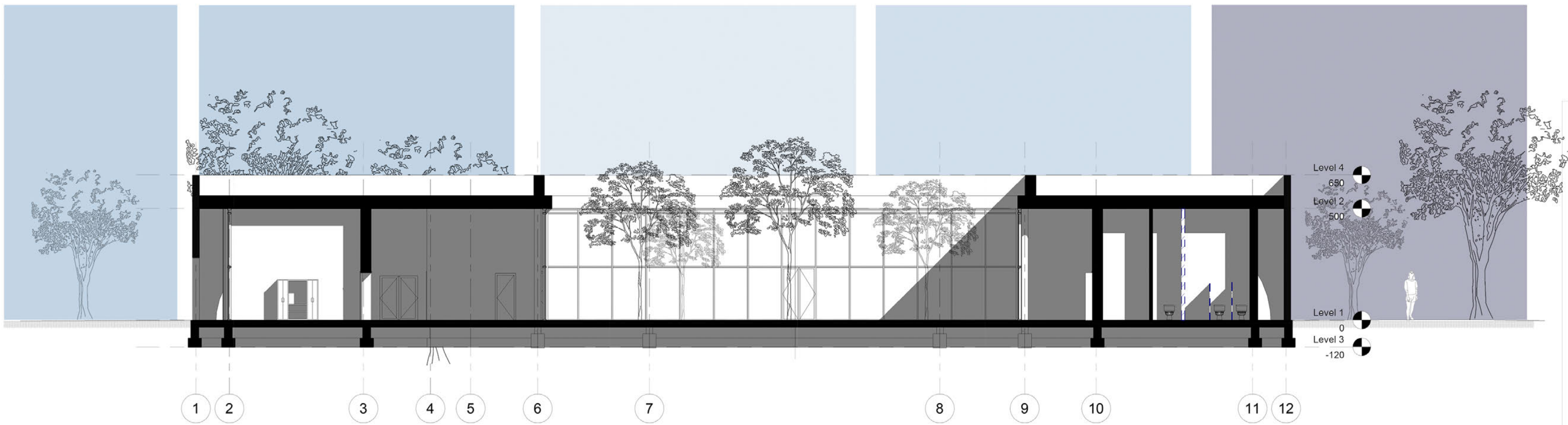
1 Section B-B 1 : 100